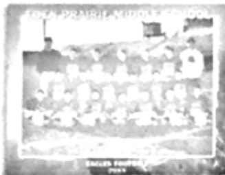
8x10 Bordered Team